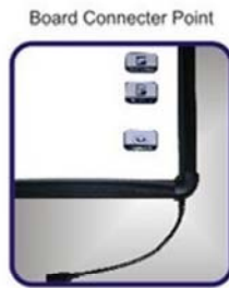
Board Connector Point