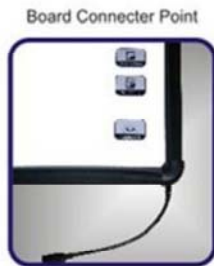
Board Connector Point